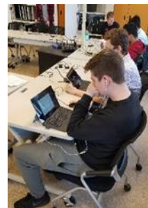
Anthis Programming Student