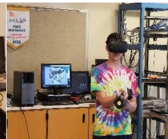
Virtual Reality Programming