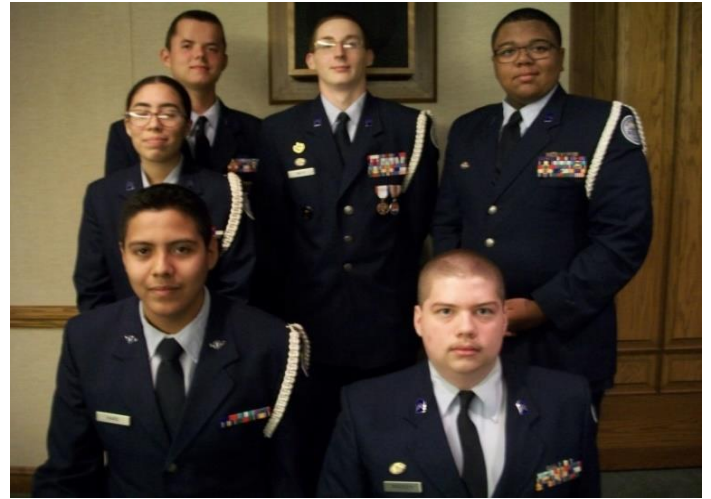
Wayne High School AFJROTC Cadets